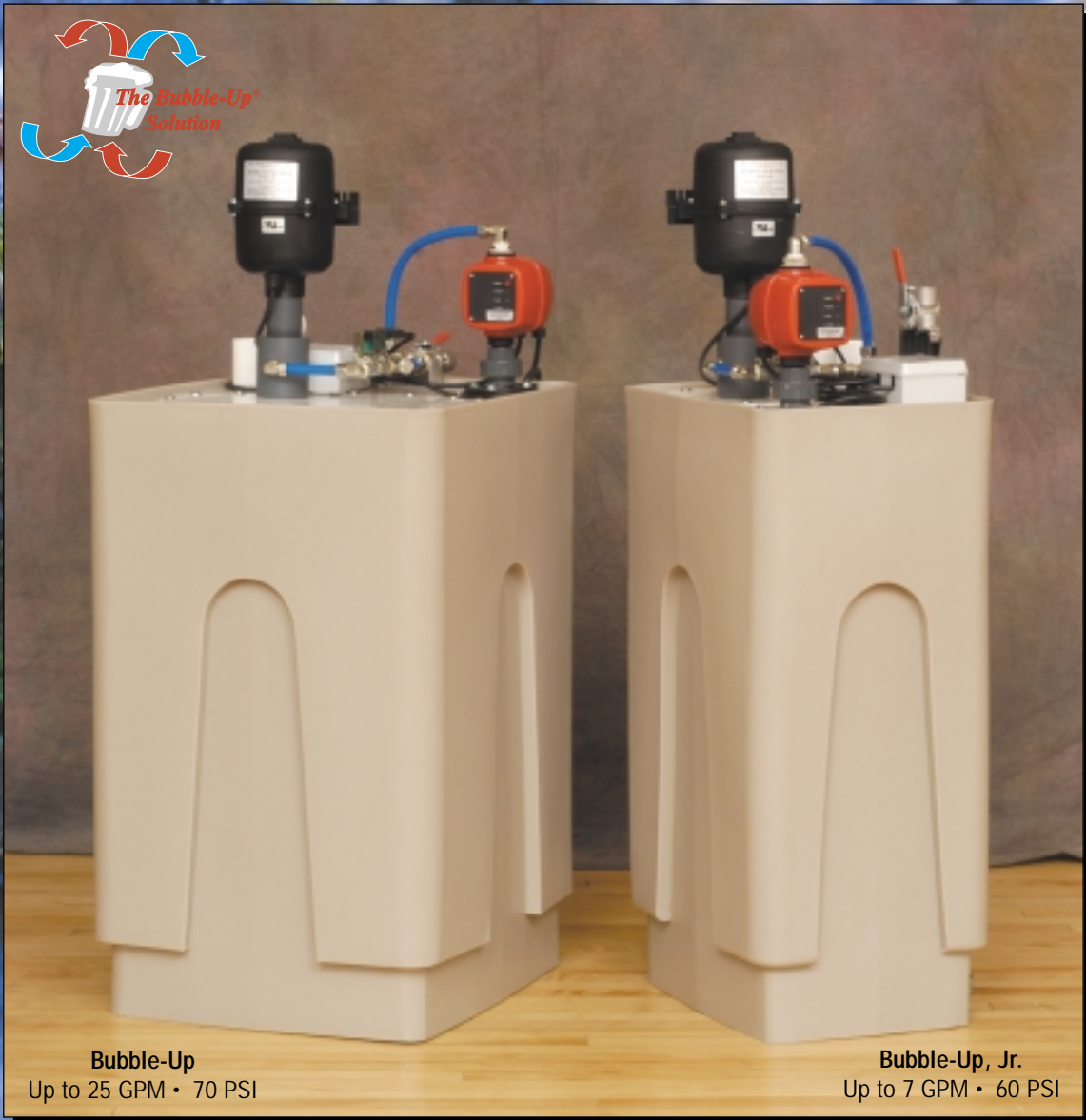
Bubble-Up Up to 25 GPM • 70 PSI

At last, an answer to radon plagued water. INTRODUCING THE BUBBLE-UP SYSTEM.