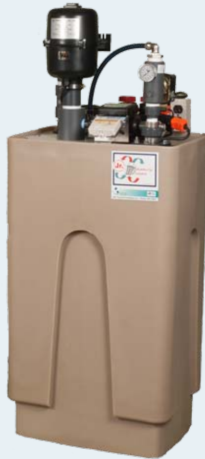
Bubble-Up® Jr. Interactive™

Building on the advantages of compact size, 99% efficiency, quiet operation, high pressure, and clean, neat installation, R.E. Prescott Company has added safety features with the REPCO Meter Control and the REPCO Water Alarm Valve.