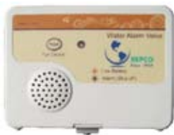
Water Alarm Valve

Your water is aerated and blown into the inside cup. Radon is bubbled up and out. Your clean water overflows the brim of the cup, and a built-in pump automatically delivers it to your home.