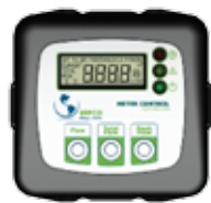
Digital Flow Meter