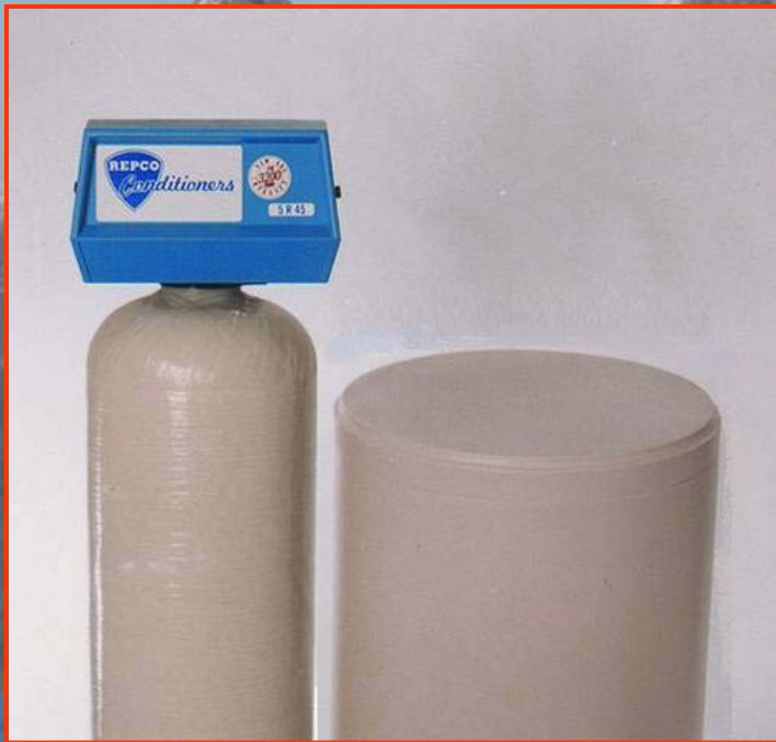
Model 2510 Control Valve